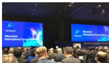
The MOONShot conference room