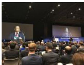
Naokazu TAKEMOTO, Head of the Science and technology Ministry