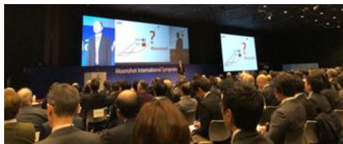
Masatoshi Son (Head of SoftBank) delivers a stimulating and visionary address