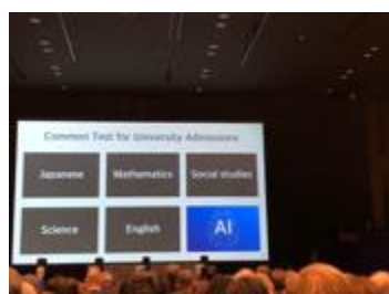
AI is expected to be a major discipline in the next 50 years